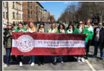
St. Patrick's Day Parade-Park Slope