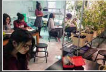
Art in the Farm