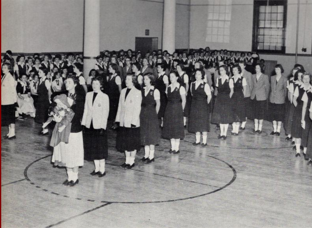
Class of '56 (seniors) in perfect formation!