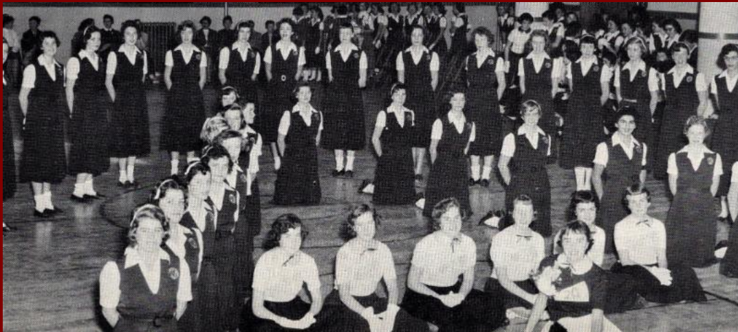
Sophs (class of '58)