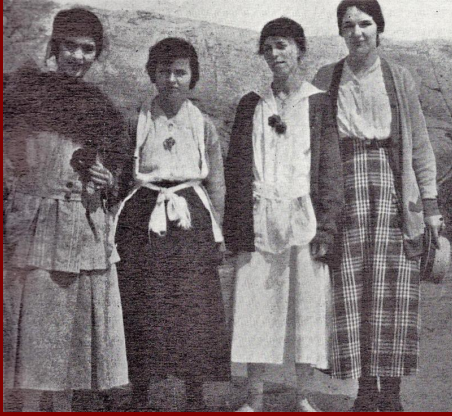
This photo is from the 1967 yearbook with a caption of "1917".

The class of 1921 was the first graduating class at Saint Saviour. While they did not have a yearbook, we like to think they were proud of their achievement which came during the women's suffrage movement and towards the end of WWI.